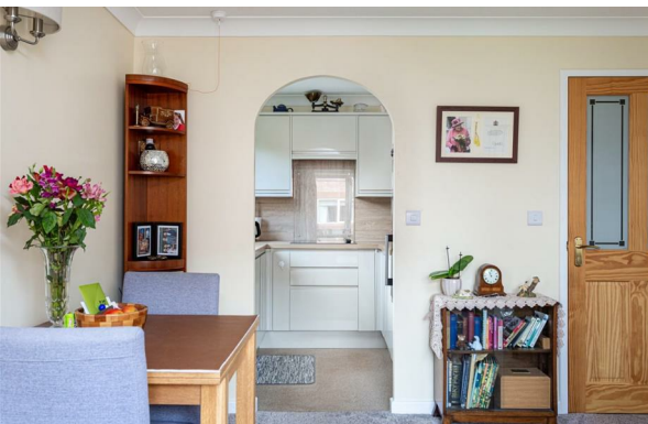
Homeyork House, Fulford, York, YO10 4QX